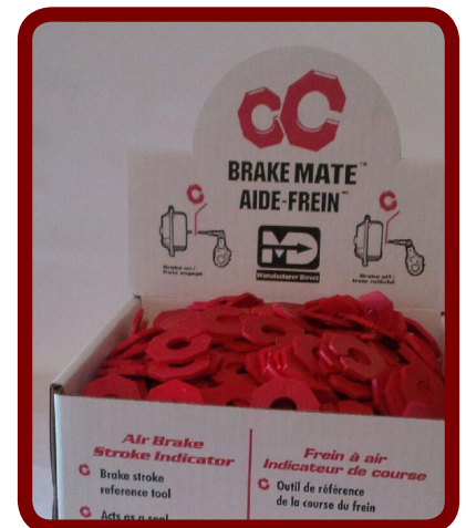
Sold in Bulk

S-100 Brake Mate – 20,24,30 & 36 Brake Chambers 5/8" Push Rod